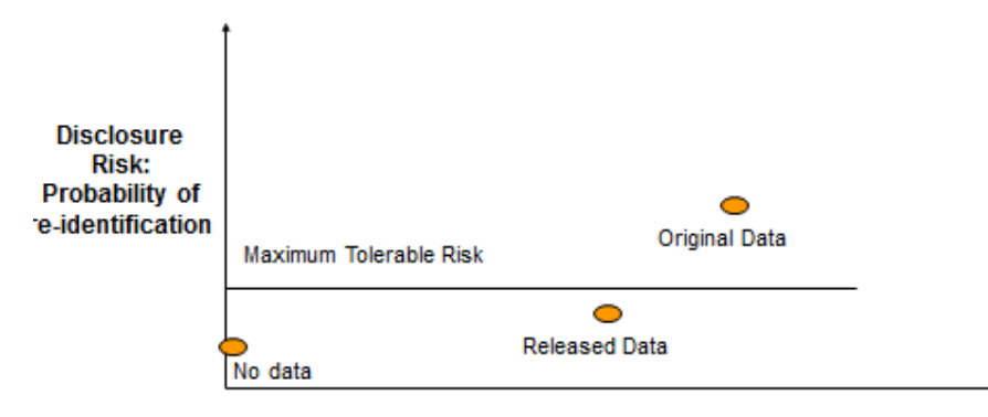
Data Utility: Quantitative measure on the statistical quality

The disclosure risk and utility measures can be used to produce a disclosure risk-data utility confidentiality map (Duncan, et al. 2001). We conceptualize the map in Figure 1.