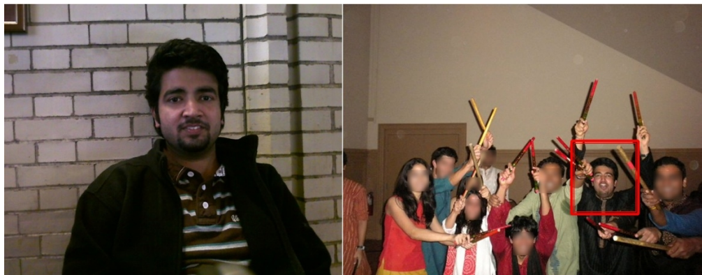
Figure 2: Experiment 2: Exemplary target shot and matched source photo for one of the participant.

two with the subject’s face slightly tilted towards either side). Then, each subject was asked to complete a short survey on a second laptop. While the subject was completing her survey, their pictures were uploaded to a cloud computing cluster and matched against a database of photos from a social network site.